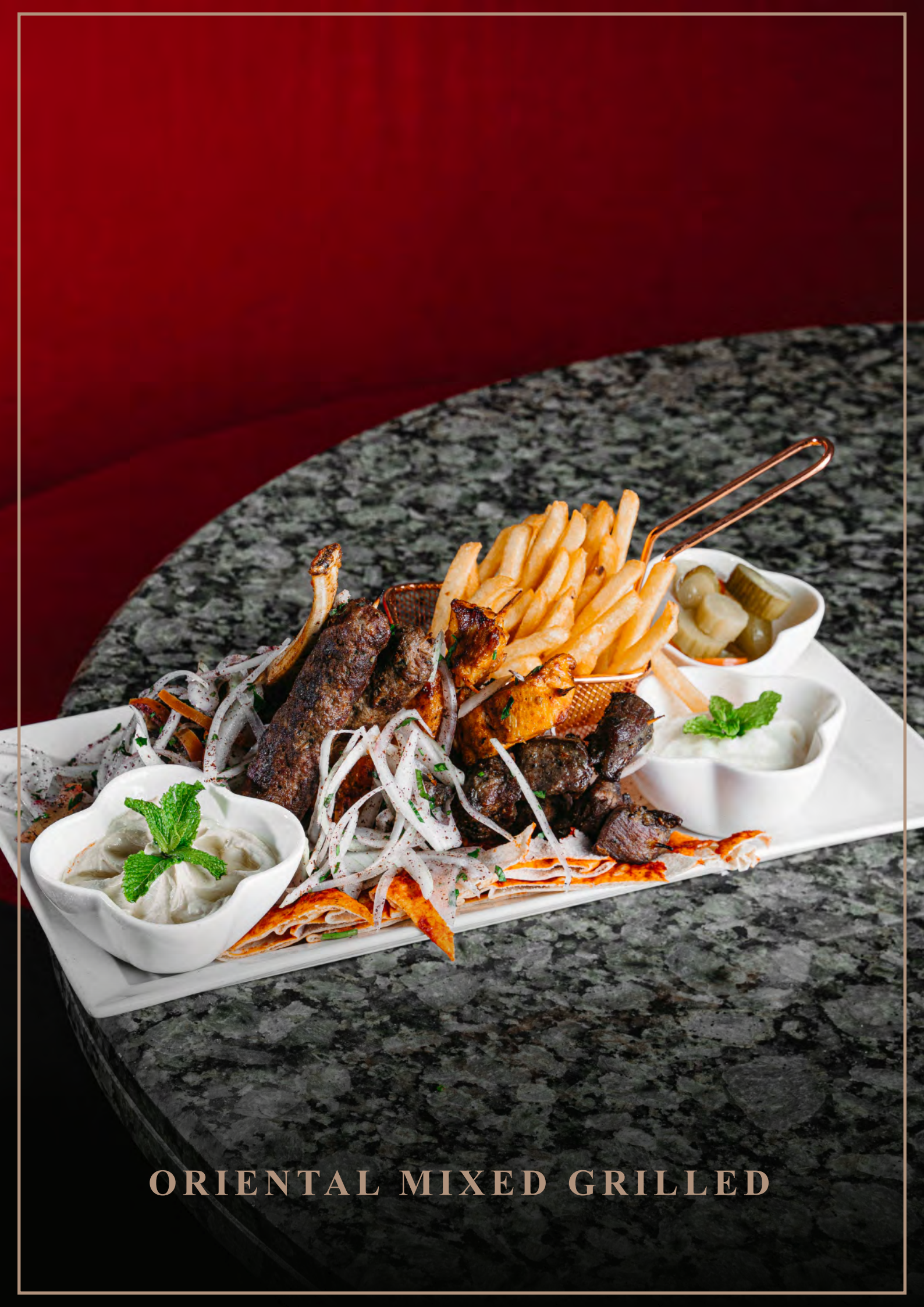
ORIENTAL MIXED GRILLED