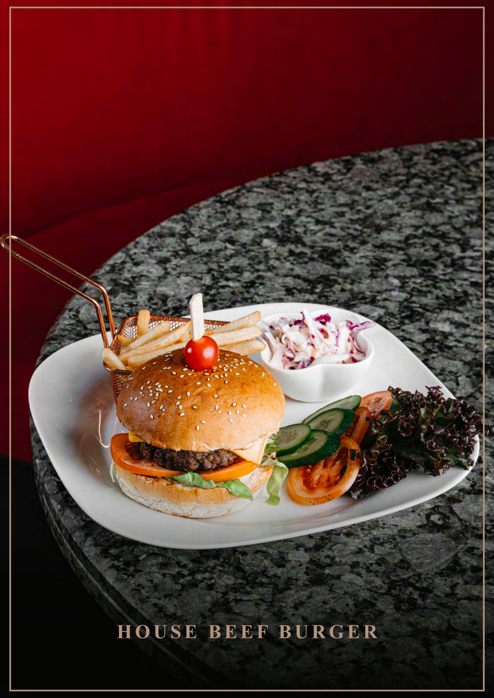
HOUSE BEEF BURGER