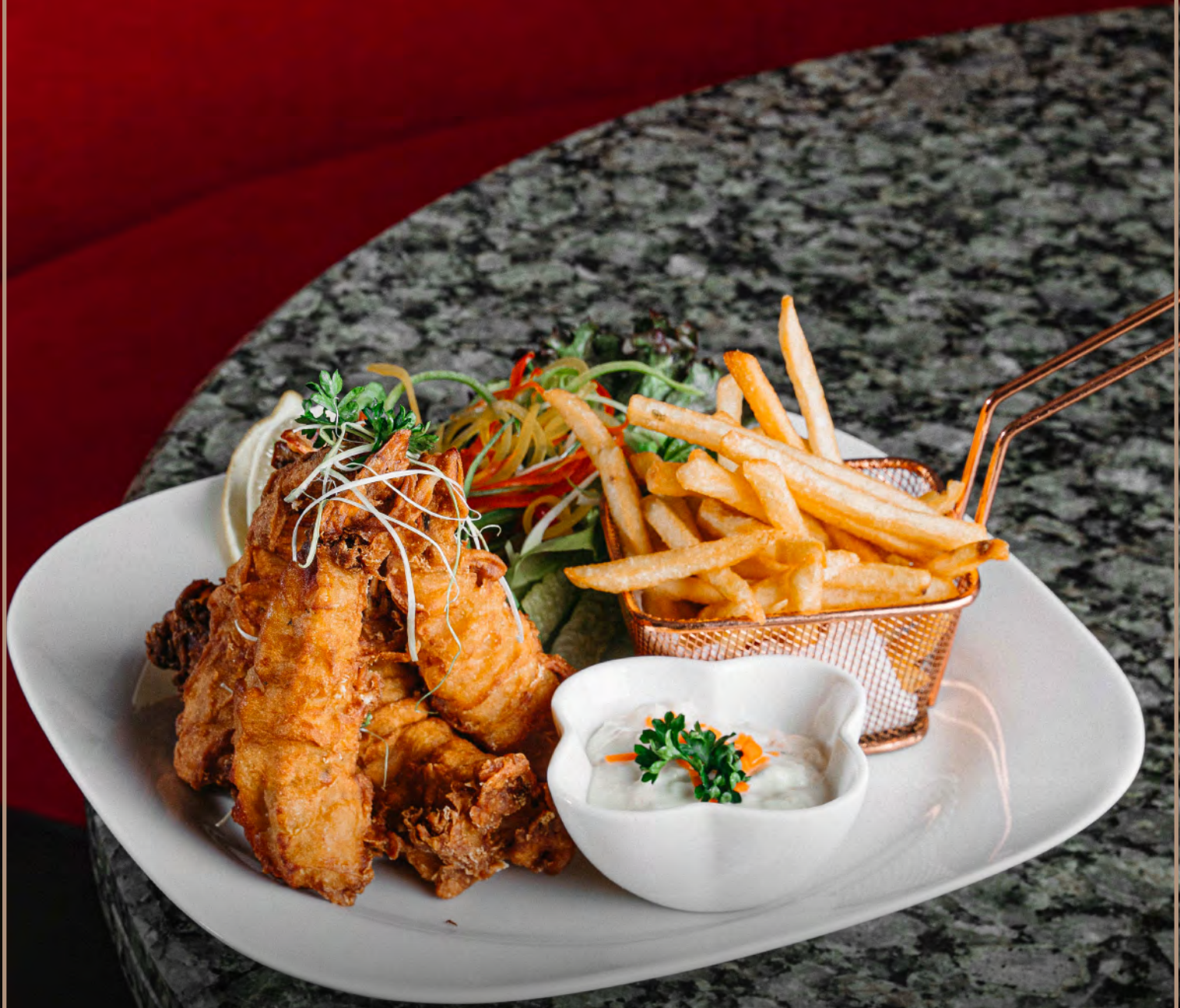
TEMPURA TIGER SHRIMP