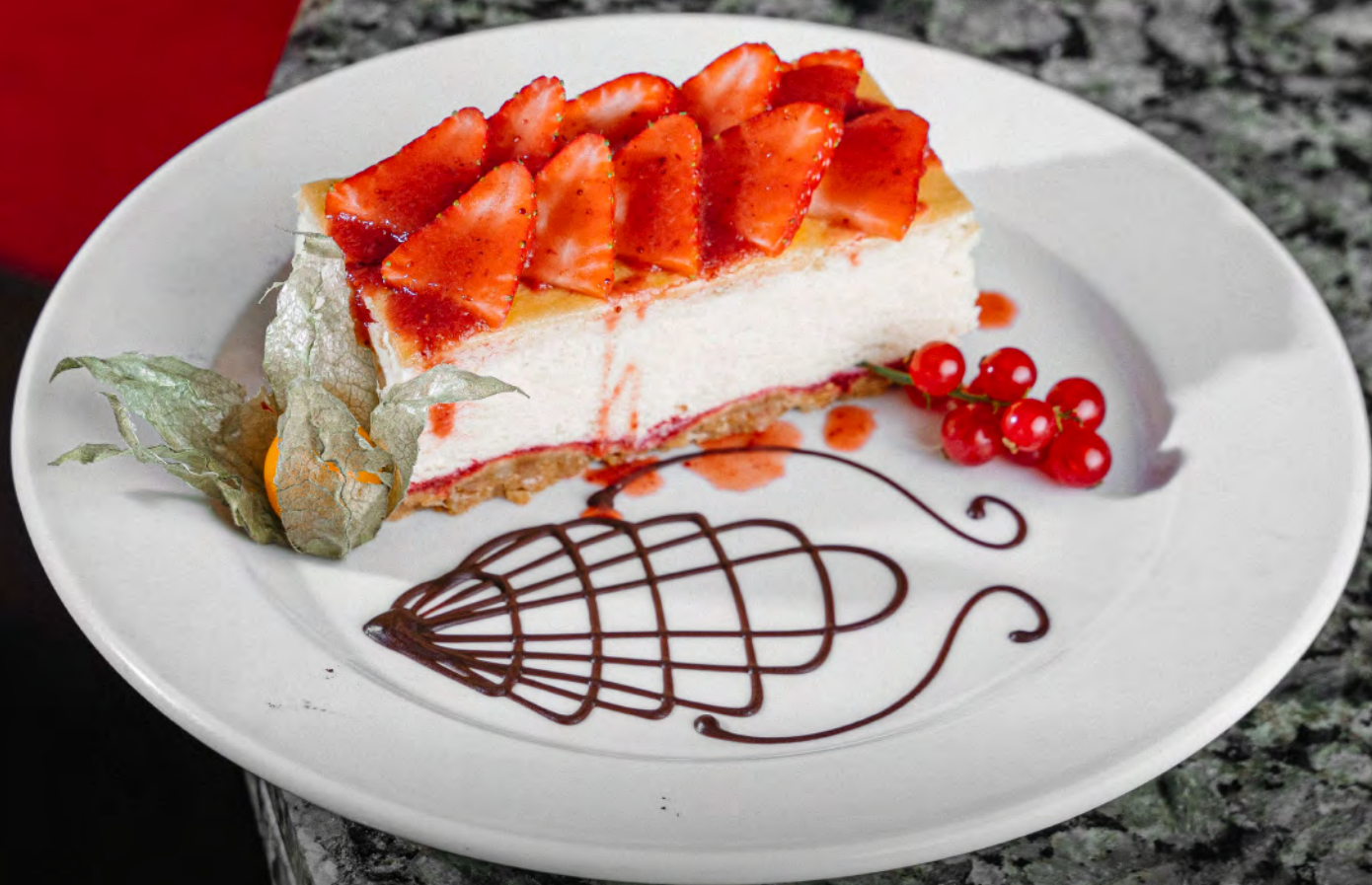
SOUR CREAM CHEESECAKE